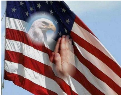
GOD Bless America!

PHIL BEALS, EDITOR BANG GANG NEWSLETTER PO BOX 385 NIVERVILLE, NY 12130-0385