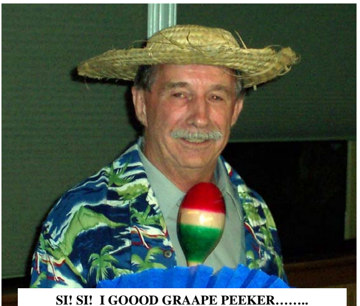
SI! SI! I GOOD GRAAPE PEEKER.....